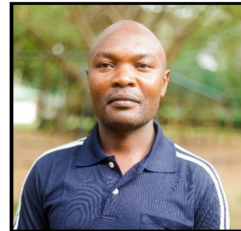
Thadeus Assenga Primary PE